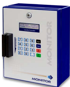
iBeam Express Kiosk