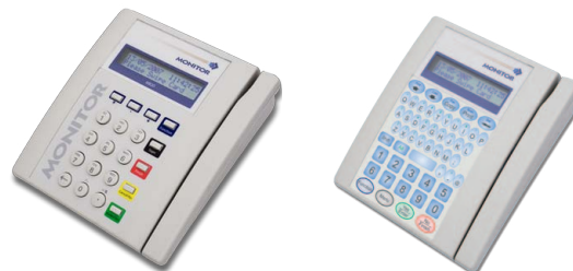
MB526 QWERTY Terminal